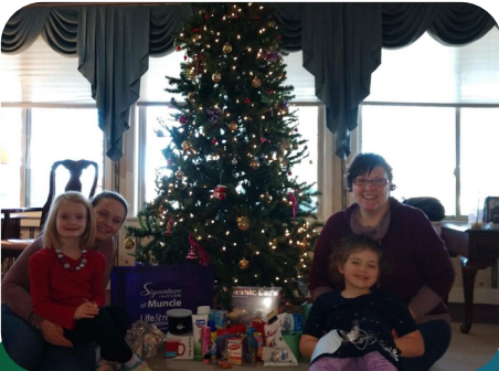
Volunteers of all ages joined us for this remarkable program. The youngest volunteer was a 4 year old who helped place cards in each AngelWish bag.