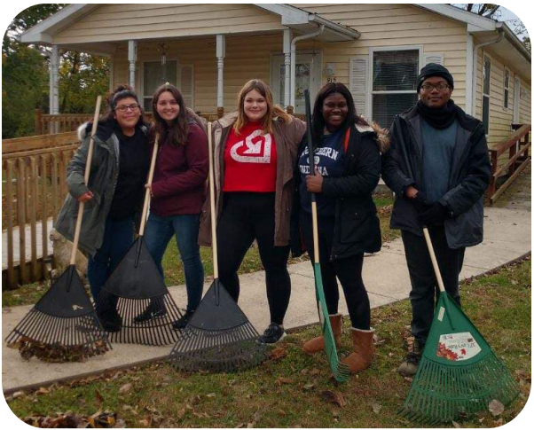
BSU LEAF RAKING A total of 342 hours were donated by 90 Ball State University students who raked the leaves for 53 senior residents of Delaware County.