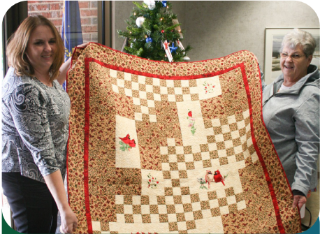
The 2019 AngelWish program saw an overwhelming amount of handmade items donated by volunteers. Items included scarves, hats, quilts, afghans, and washcloths.